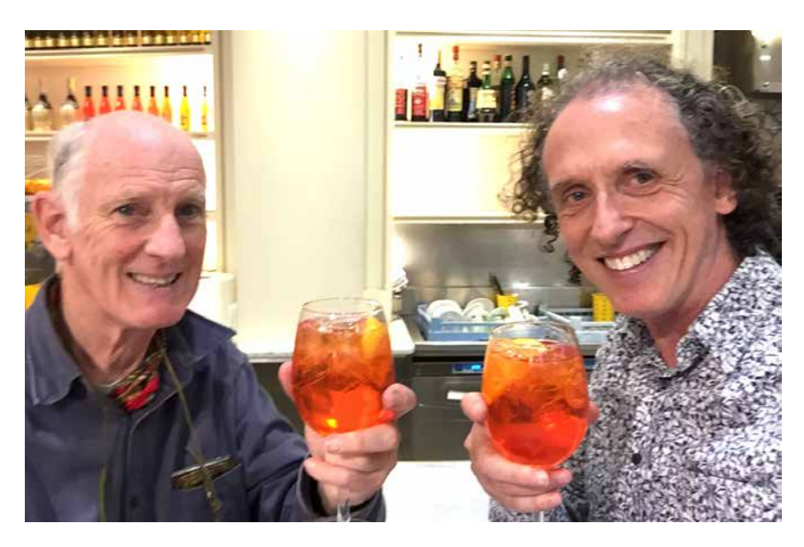
Two Shintaido instructors enjoying an Italian spritzer at Pisa airport on the way home. A case of two otherwise intelligent individuals making an unwise collective decision?

In the end, this is the greatest Shintaido deficiency of all. The constant need for reinvention and debate becomes exhausting. It takes us away from those we love, who come to resent the very word "Shintaido". Worse, it occupies all our waking thoughts when they should be focussed elsewhere. For an instructor with a 9-5 job, and the ability to switch their focus on and off at will, this might not be so bad. But for a self-employed creative like myself, needing to constantly focus on his own artistic practice, it can become a deeply destructive habit. It takes me away from the one thing which defines who I am. My work as a silhouettist is central to my life, and rightly so. Yet it languishes, abandoned for months on end while I involve myself in Shintaido events. To what end? Can I really make a difference to Shintaido? Sadly, no. Will I still end up voting against my better judgement? Sadly, yes.