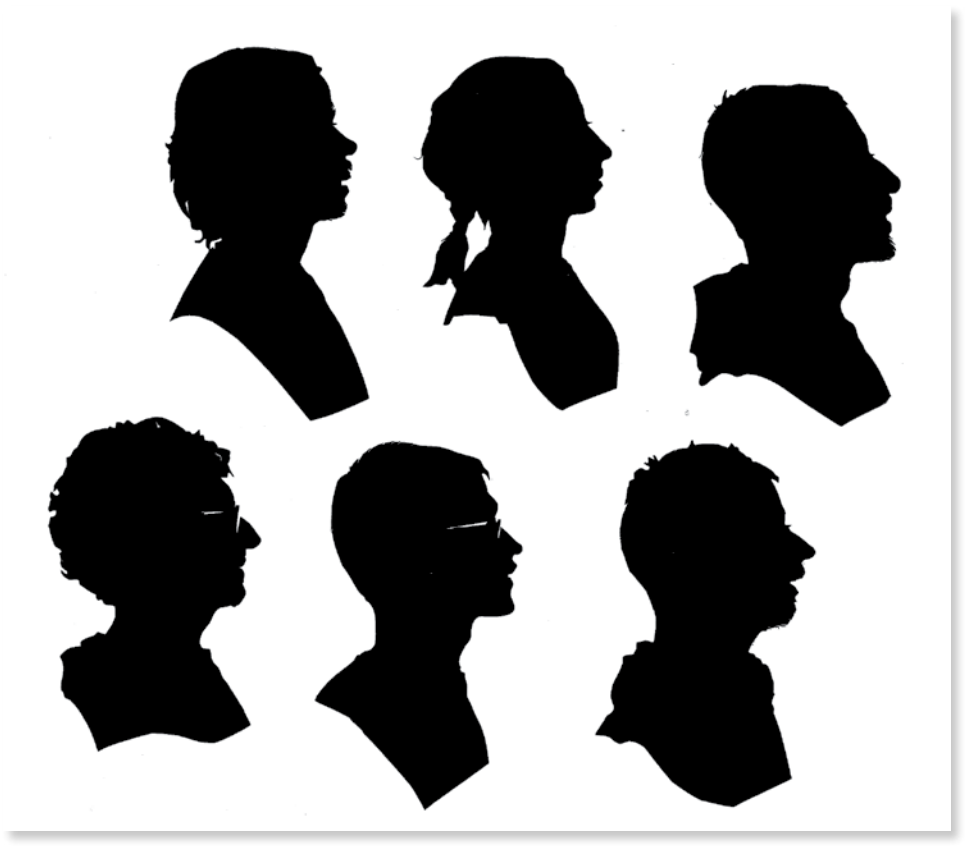
Silhouettes of the Italian organising team, cut with scissors during the final lunch. This team were the undisputed stars of the show.

High-level Shintaido instructors are extraordinary people. After long years of personal practice, and the dedication needed to establish a Shintaido career, Shintaido seems to magnify their personalities. They become larger, brighter versions of themselves. Such Shintaido personalities are hugely attractive. This is one reason why I, and many others, long to be one of them. Wouldn't it be great if I too could shine with a light to bright, could burn with that Shintaido flame?