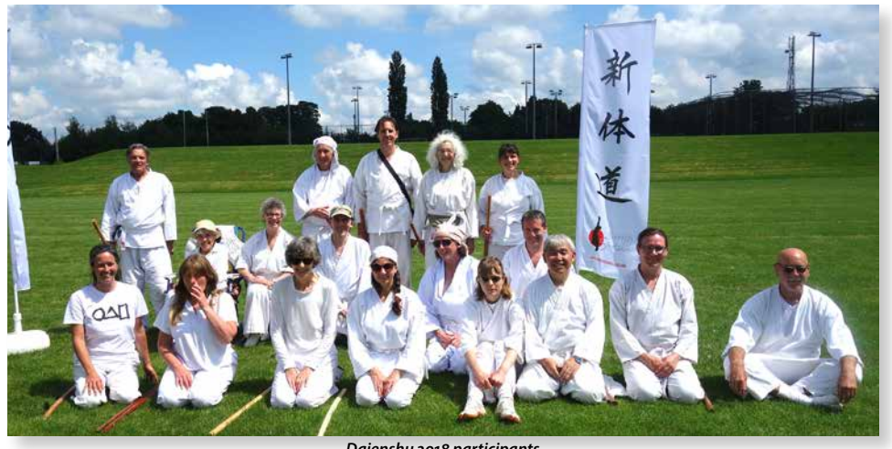
Daienshu 2018 participants

Notes on the Daienshu at the Pioneer Centre, 1-3 June 2018.