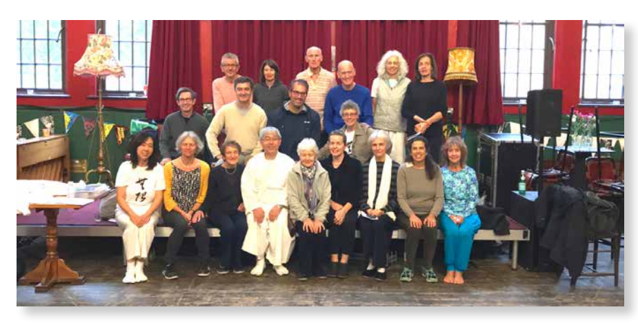
Participants to the Mugen Workshop: London 24th September 2017

We also did a partner exercise where pairs, and then fours massaged each other's necks and backs. And then there was a kumite with one person pulling or rowing back and forth while grasping the hands of the other, going to the side and then shaking. This was much enjoyed and very powerful.