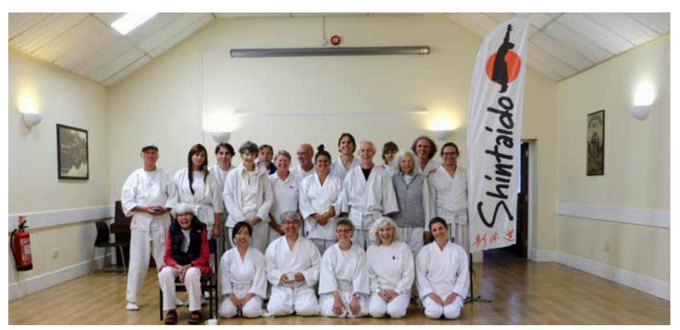
Daienshu 2017 Partipants